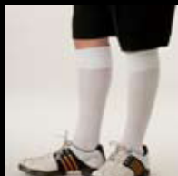
Plain White Socks