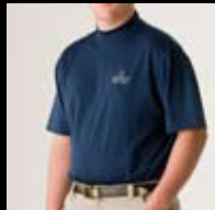
Collarless Golf Shirt