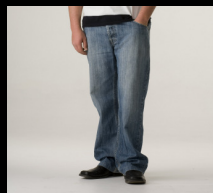
Denim shirts or jeans of any description

Management has the right to refuse entry at all times.