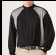
Golf Style Skivvy