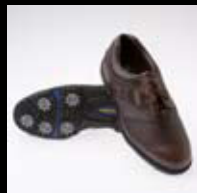
Soft Spike Shoes