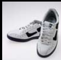
Sport Golf Shoes