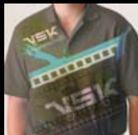
Shirts with excessive prints