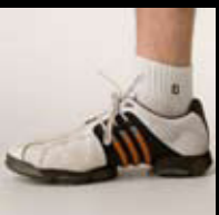
Logo other than Club's