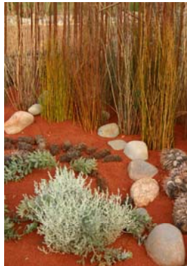
Cranbourne Botanic Gardens

Plantmark have a huge range of drought tolerant plants that have low water requirements. See suggestions below.