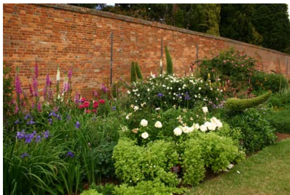
An example of a Cottage Garden