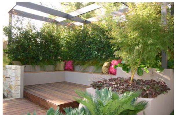
An example of a Contemporary Garden