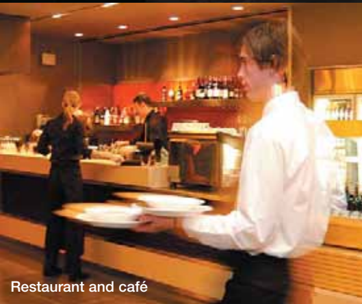
Restaurant and café

Featuring a $1.5million pumping station, over 2 million litres a day of Class A recycled water is available to Sandhurst Club to water the entire development, including all golfing areas.