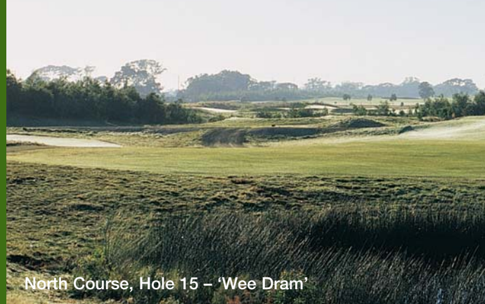
North Course, Hole 15 – 'Wee Dram'