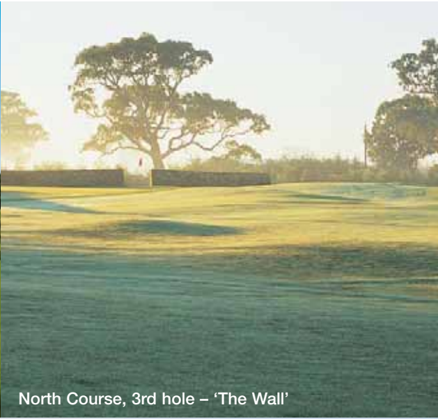
North Course, 3rd hole – ‘The Wall’