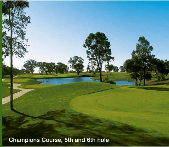
Champions Course, 5th and 6th hole

So why not be part of active and vibrant, forward thinking, well financed club today?